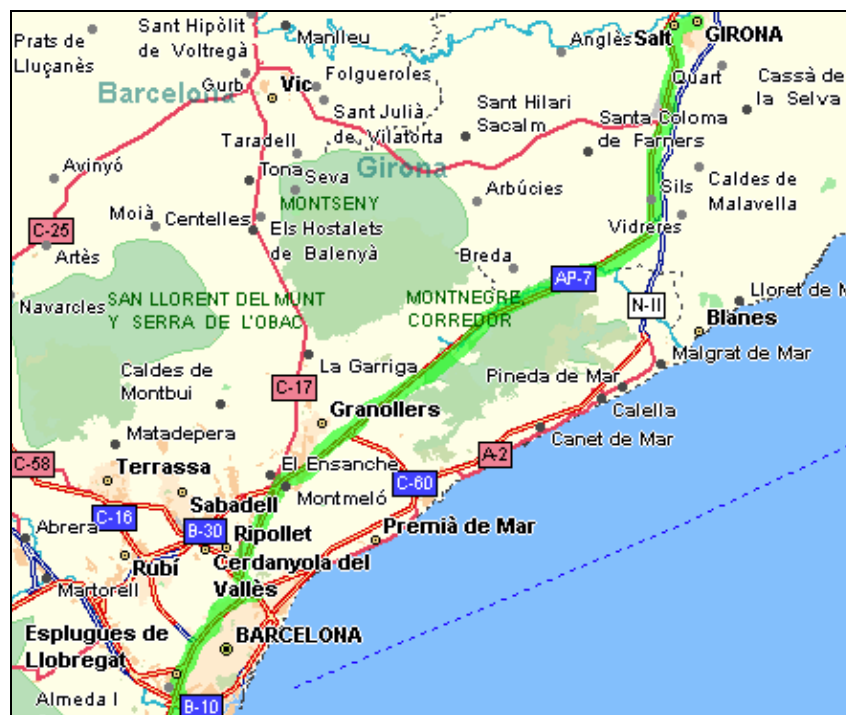
Map 1: Barcelona to Girona

NOTE - You can pay road tolls in the "automatic" lanes using a credit card or you can go to the "manual" ones and pay cash.