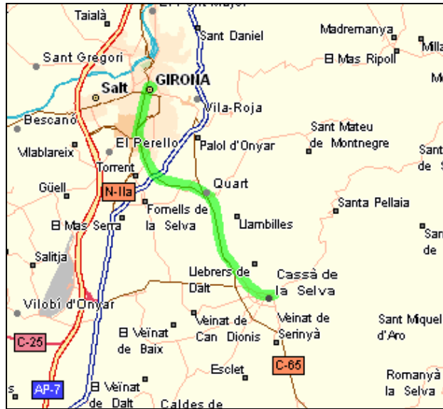
Map 2: Cassà de la Selva to Girona

Girona Airport is located about 12 Kms from the city of Girona and can also be reached quickly by taxi (approx. cost 20€).